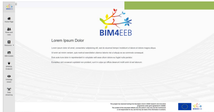
Figure 2 BIM4EEB platform

At present, the partners have defined the user profiles for accessing the BIM Management System and the overall schema for visualising ontologies and data. A draft of the web interface for the system has already been developed and it will be improved and implemented in