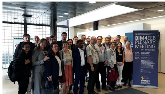
Figure 1 BIM4EEB partners